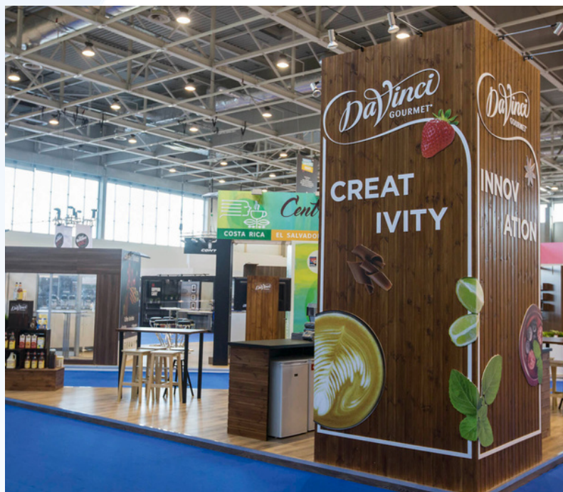
▼ ITU 2019 - Angola stand