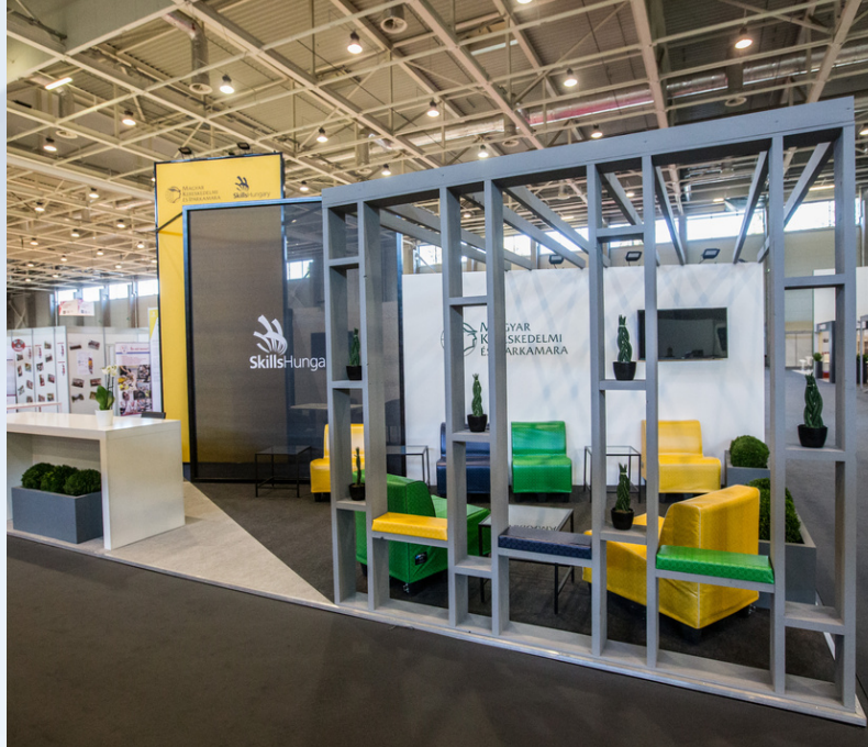
▲ Euroskills 2018