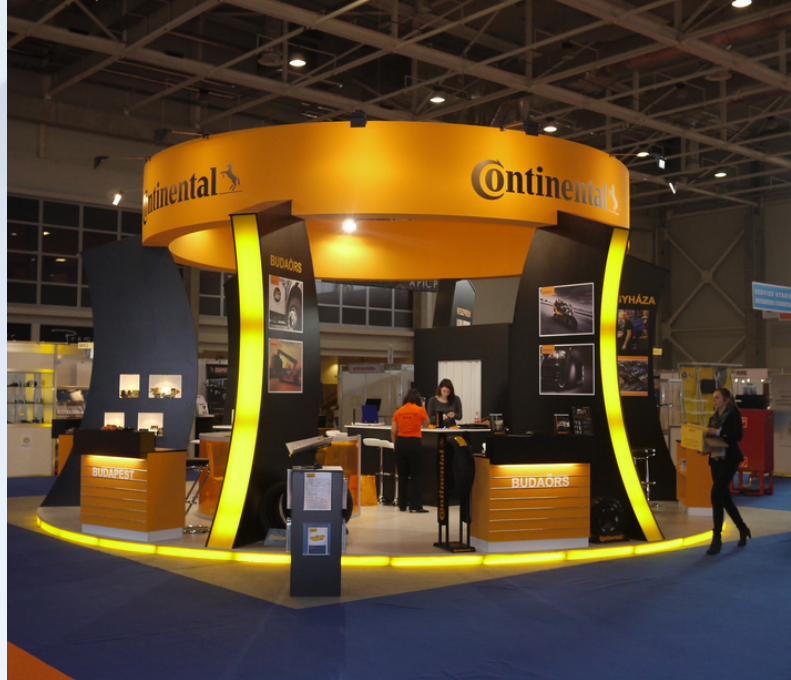
▲ 3M, Continental, Inno Robotics